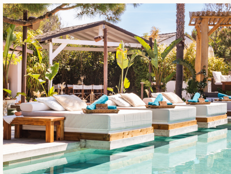
DOUBLE BED BY THE POOL

**Bottle to be selected from our Bottle Service menu.