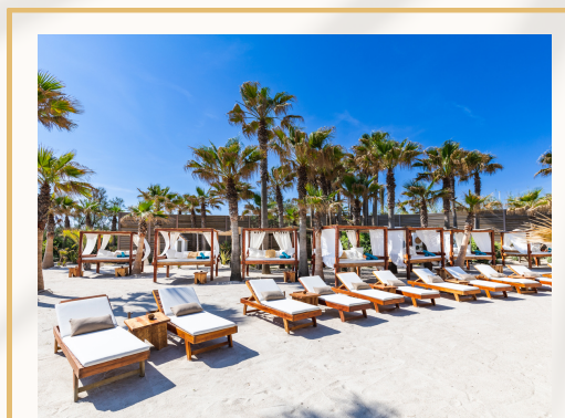
OPIUM BED - SUN LOUNGER