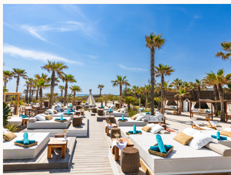
DOUBLE BED BY THE DECK

**Bottle to be selected from our Bottle Service menu.