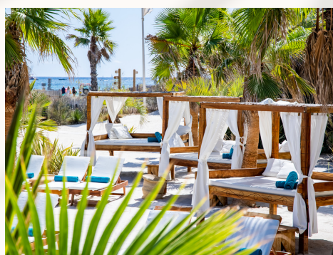
OPIUM BED - SUN LOUNGER