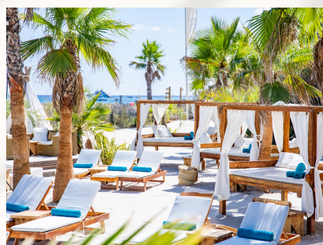
OPIUM BED - SUN LOUNGER