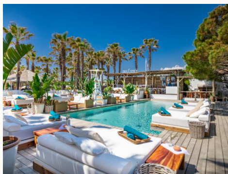
DOUBLE BED BY THE POOL

**Bottle to be selected from our Bottle Service menu.